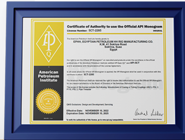
API - 5CT