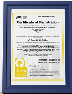
API - Q1 - 9th Edition