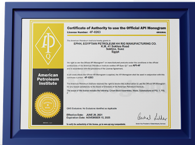
API - 4F